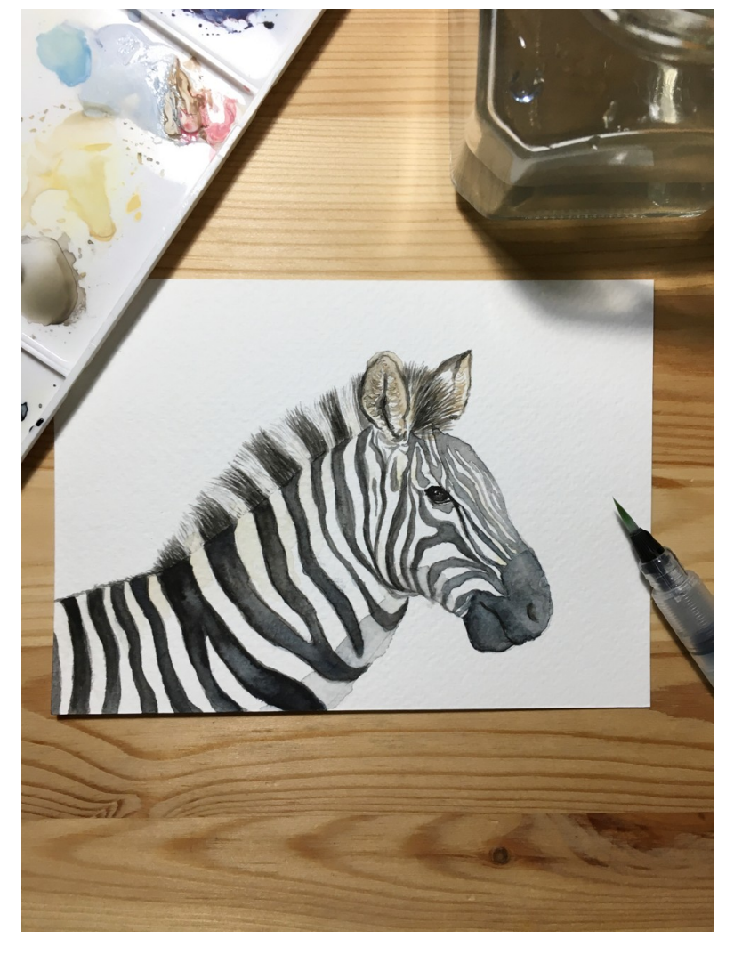
One of Ng's watercolour paintings.